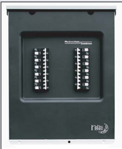
Shown with 12 300VDC breakers with deadfront installed (metal lid removed)