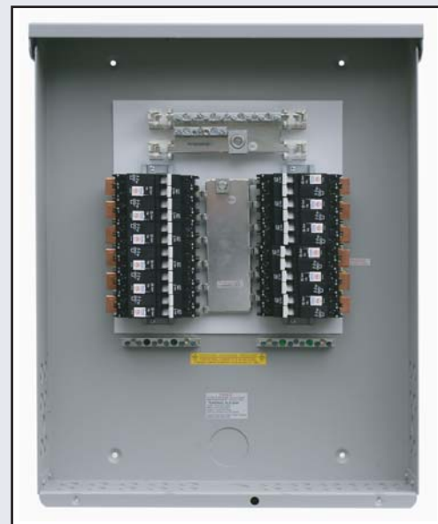
Shown with deadfront & lid removed