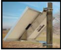
Series 4011 (Special Order) for 2" (50 mm) Schedule 40 or 80 steel pole, outside dia. 2.375" (60.3 mm)