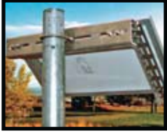
Series 4000 (Special Order) for 2" (50 mm) Schedule 40 or 80 steel pole, outside dia. 2.375" (60.3 mm)