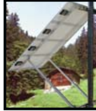
Series 4002 (Special Order) with SolarMount® standard rails for 2.5" (65 mm) Schedule 40 or 80 steel pole, outside dia. 2.875" (73.0 mm); 3" (80 mm) Schedule 40 or 80 steel pole, outside dia. 3.500" (88.9 mm); or 4" (100 mm) Schedule 40 or 80 steel pole, outside dia. 4.500" (114.3 mm)

For the Price List for Series 4002 lists pole sizes for each model. See page 38.