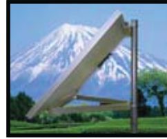
Series 4012 (Special Order) for 2" (50 mm) Schedule 40 or 80 steel pole, outside dia. 2.375" (60.3 mm)