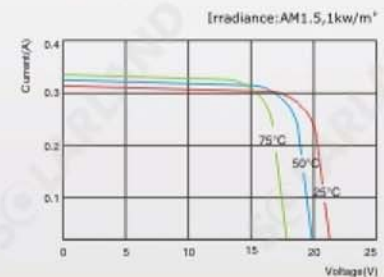
SLP005-12 I-V Curves