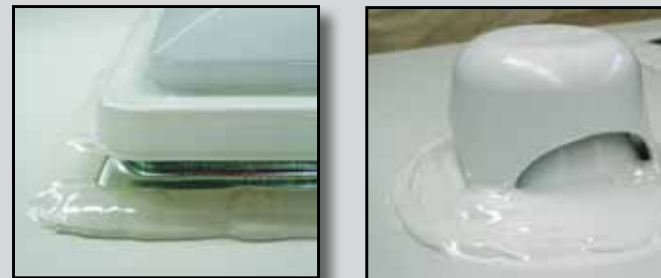
■ Sikaflex®-715 exhibits excellent semi self-leveling & flow characteristics.

The typical RV has a variety of roof penetrations around screws, skylights, vents and antennas. These items have a wide range of profiles that must be sealed completely to prevent water intrusion. With Sikaflex®-715 the sealant is semi self-leveling which means the product stays where it has been dispensed. The product flows just enough to conform to the profile of the items but will not flow away from the profile. The viscosity of the product covers fasteners such as screws not allowing the fasteners head to be exposed. Sikaflex®-715 conforms to trim profiles, bridges gaps and fills low spots. Sikaflex®-715 provides proven performance!