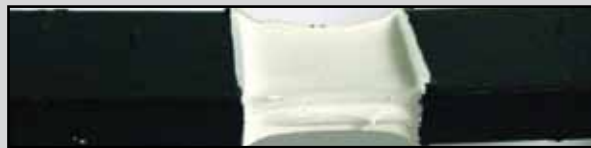
■ Sikaflex®-715 is a “cured” product and demonstrates good flexibility and retains its shape.