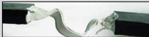
■ Traditional sealant has stringy, putty like substance and easily pulls apart and breaks.

Sikaflex®-715 provides a durable sealant!