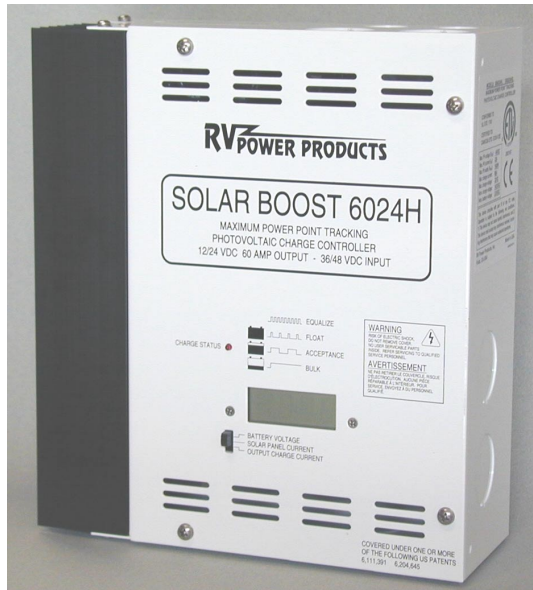
Solar Boost 6024H Pictured with optional digital display

HIGH VOLTAGE INPUT - MAXIMUM POWER POINT TRACKING PHOTOVOLTAIC CHARGE CONTROLLER