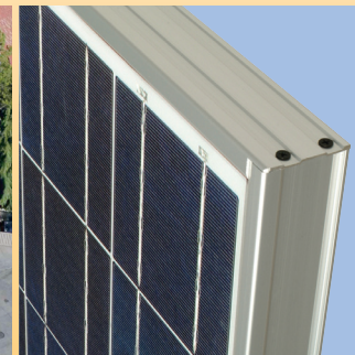
Improved Frame Technology