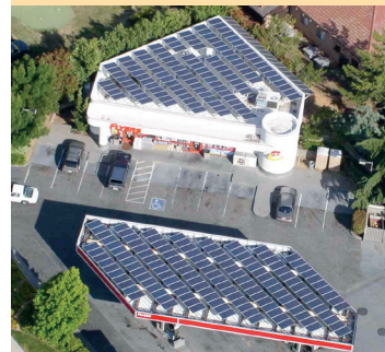
Sharp multi-purpose modules offer industry-leading performance for a variety of applications.

This module uses an advanced surface texturing process to increase light absorption and improve efficiency.