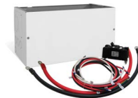
XW+ Installation Kit for INV 2 INV 3 PDP