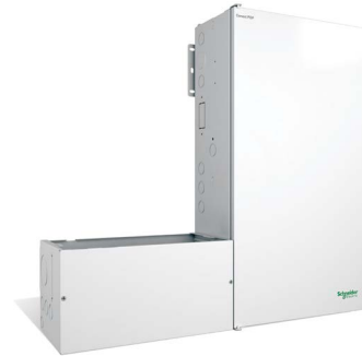
XW+ Power Distribution Panel