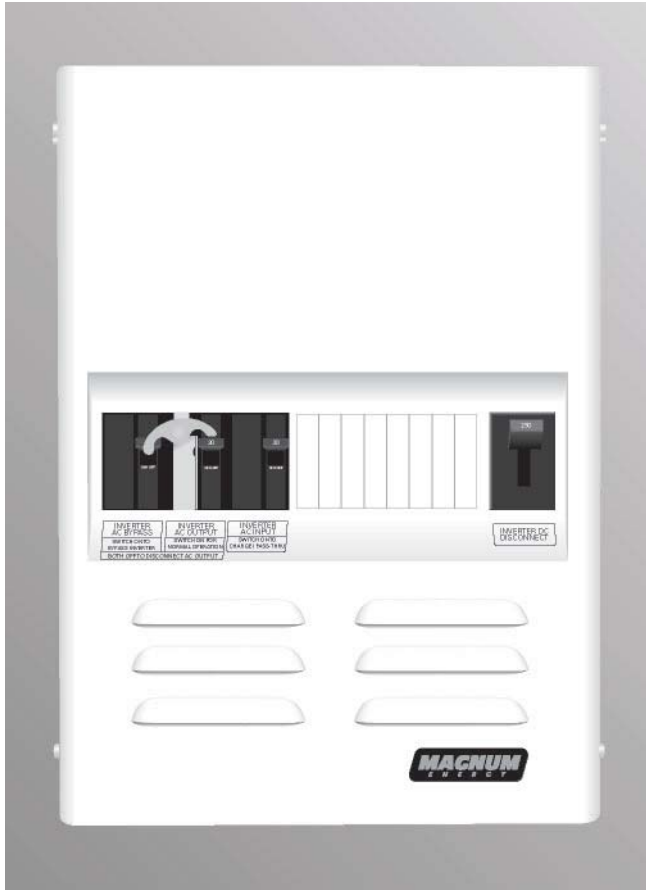
The MMP Enclosure