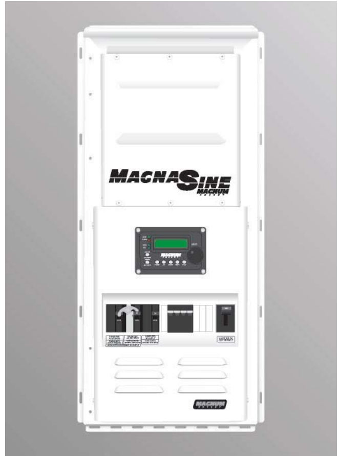
The MMP shown with inverter (sold separately) and optional remote and backplate.

The MMP – Mini Magnum Panel is an inclusive, easy-to-install panel designed to work with one Magnum MS-AE, MS-PAE, MS, RD or other non-Magnum inverter/charger.